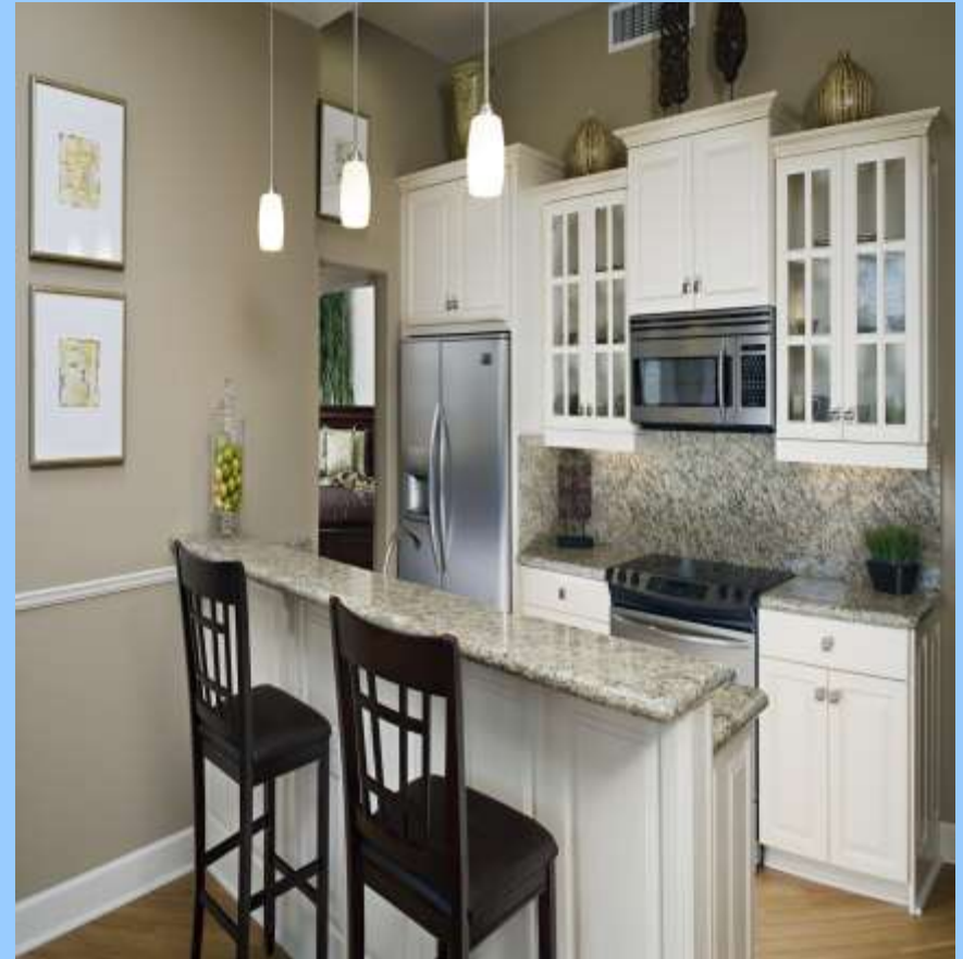
Art Deco Style Apartment