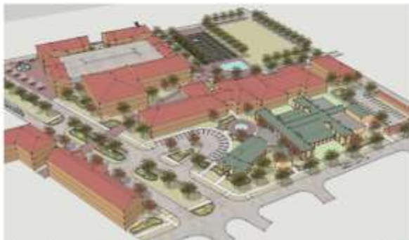
Proposed Site Masterplan - Aerial View August 21, 2008