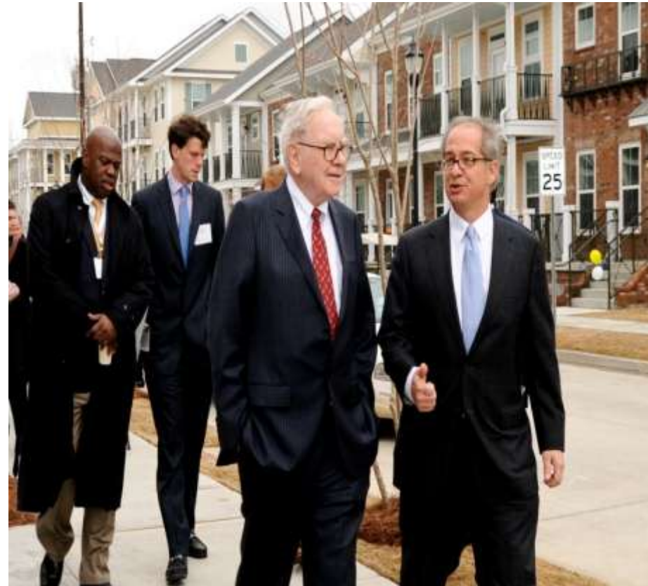
Warren Buffett tours Columbia Parc March 2, 2010

Golf RFP awarded by City Park March 28, 2010