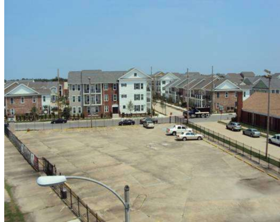
Columbia Parc at the Bayou District -August 2010 View looking north from I-610