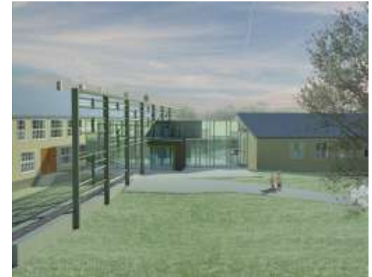
Educare of New Orleans