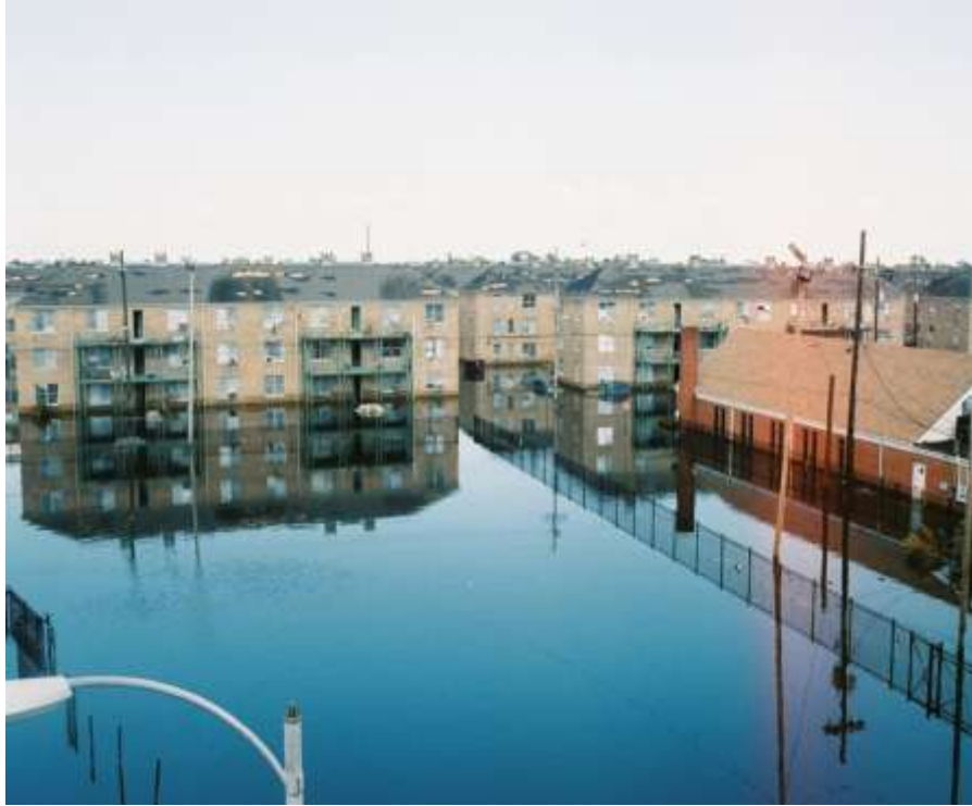
Flooding from Hurricane Katrina – Sep 2005 View looking north from I-610