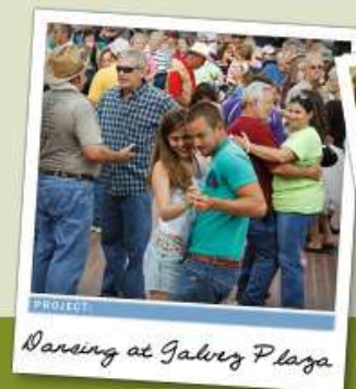
Dancing at Galvez Plaza

Repentance Park will select a consultant next week and is set to begin the design phase of the project