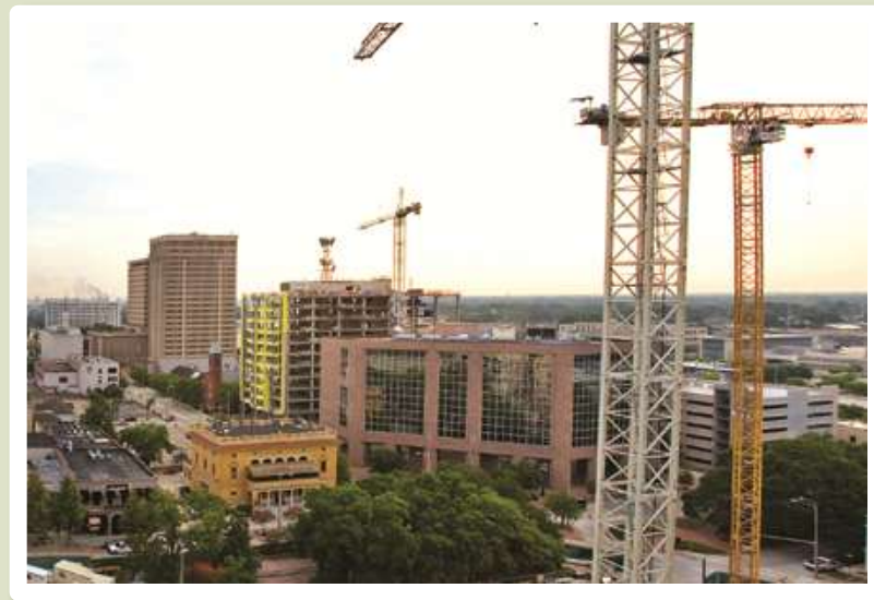
Three Cranes Simultaneously Developing a New Downtown Baton Rouge