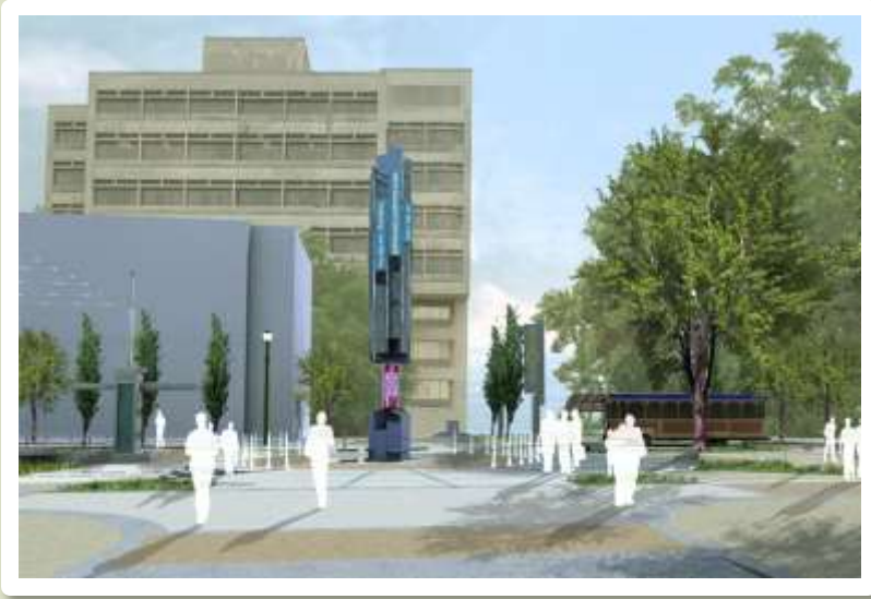
Multi-media Beacon Landmark for the Center of the New Town Square