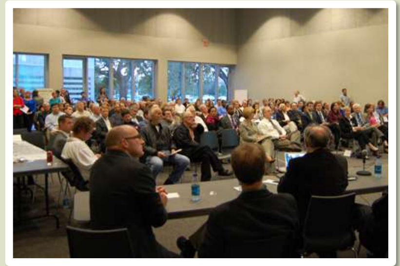
Plan Baton Rouge II Public Presentation

Many local partners and stakeholders came together to create the new master plan: