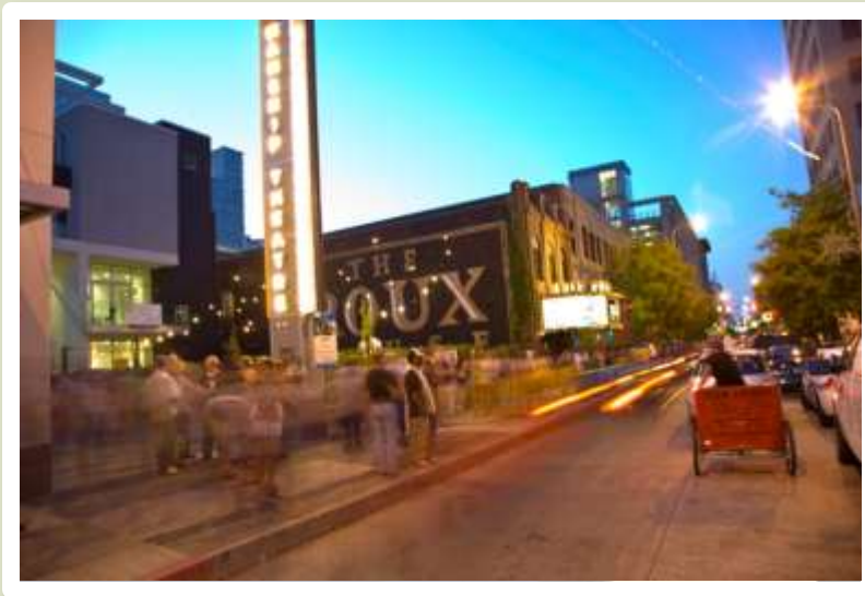
Fifteen City Blocks within the Downtown Development District