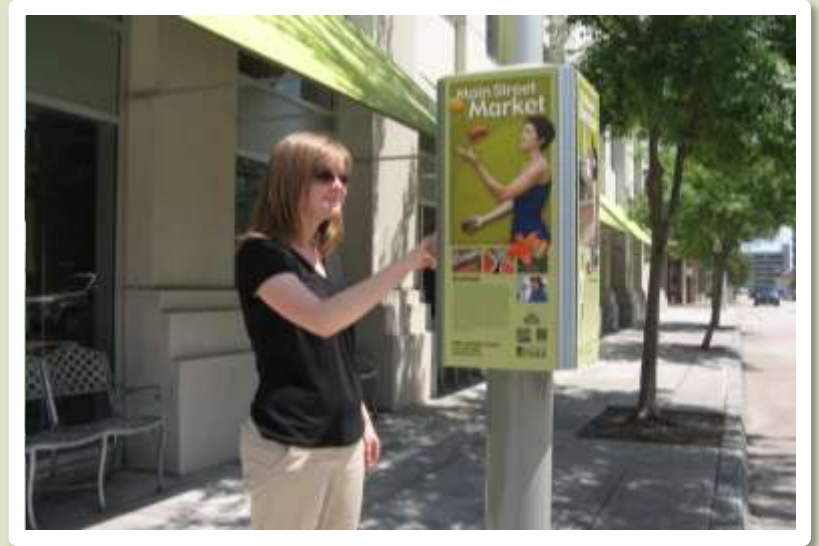
Finding your way around Downtown