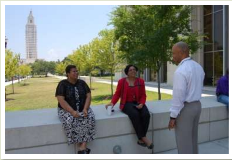
Paving the way for the new Arts & Entertainment District