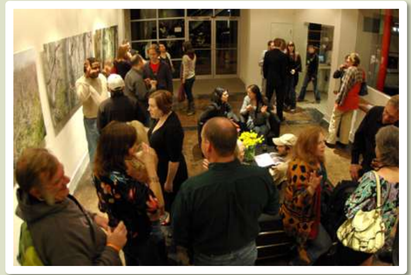
Museums & Art Galleries

Art Sales within the District are now exempt from state and local sales