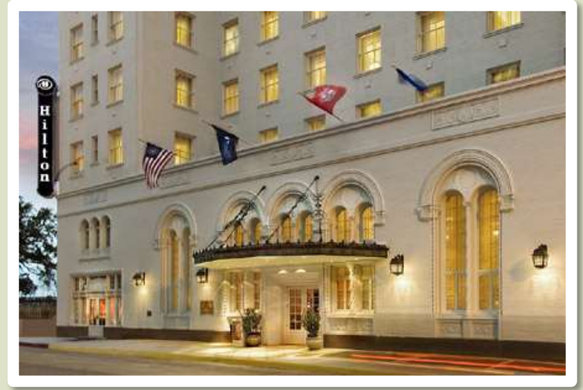
Hilton Capitol Center

One of three new hotels that set the stage for the Arts & Entertainment District