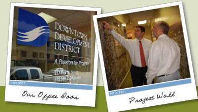
Our Office Door