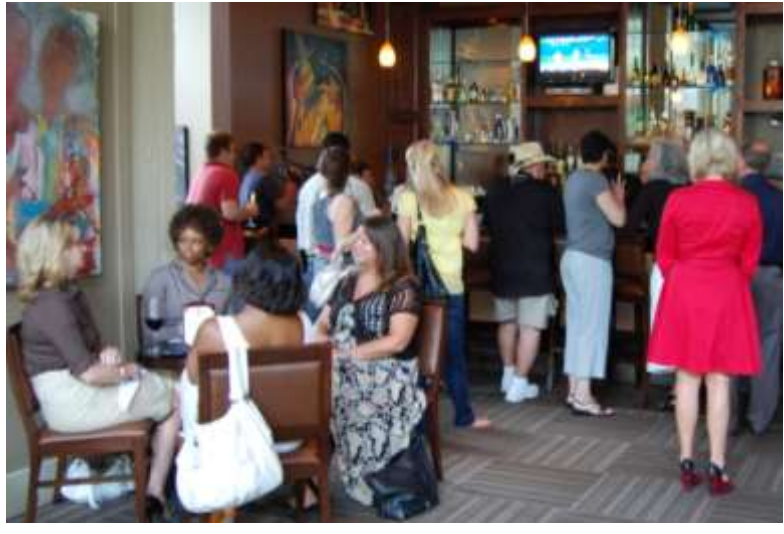
New Restaurants & Venues