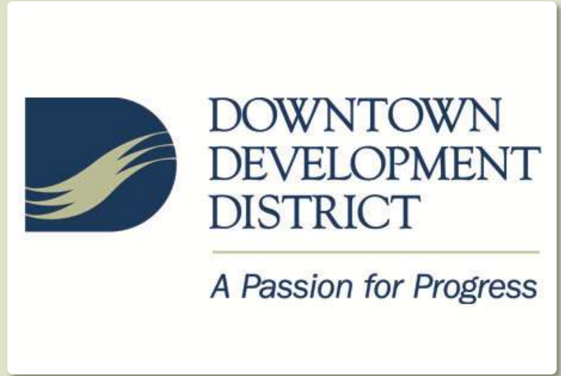
Logo Update and Tagline Development