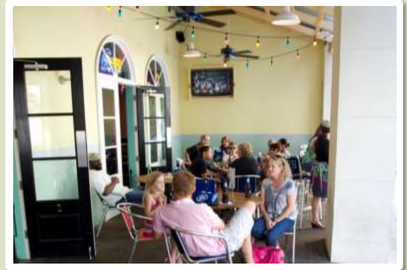
Outdoor Dining Options