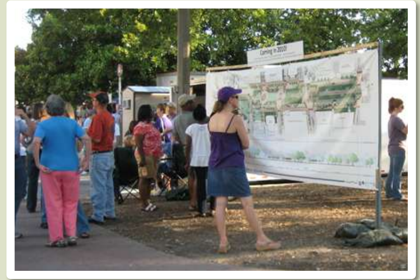
Downtown Visitors Stop and Admire North Boulevard Town Square Design

Town Square is key to “creating a sense of place” Downtown