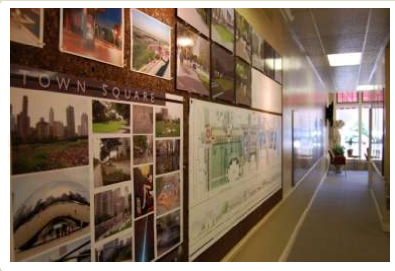
The Heart and Pulse of Downtown