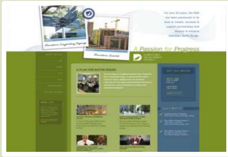
A Consumer-Focused Information Portal