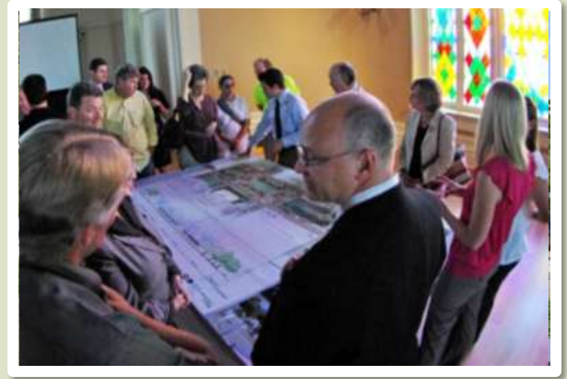
Local Team Developed Town Square Design