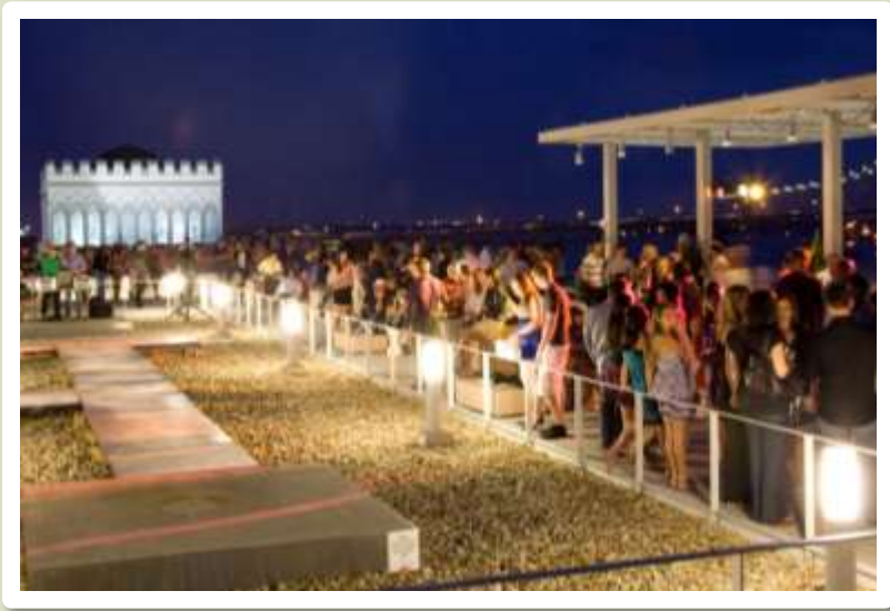
Development Due to Creative Financing