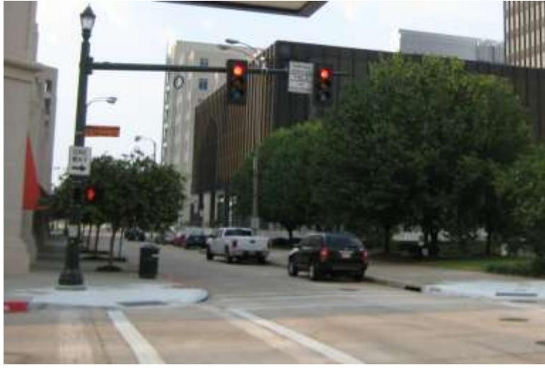
Streetlight and Streetscape Improvements