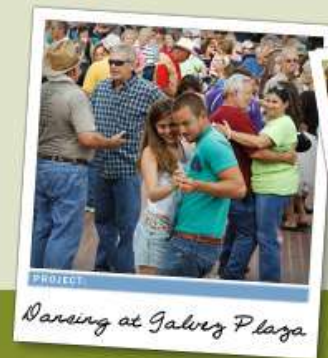
Dancing at Galvez Plaza