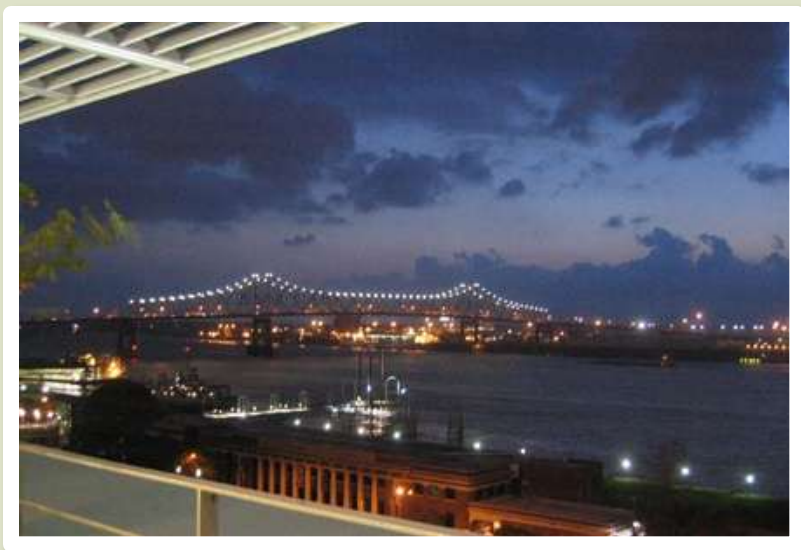
Strategic Position on the River Founded a City that now Capitalizes on Glorious Views