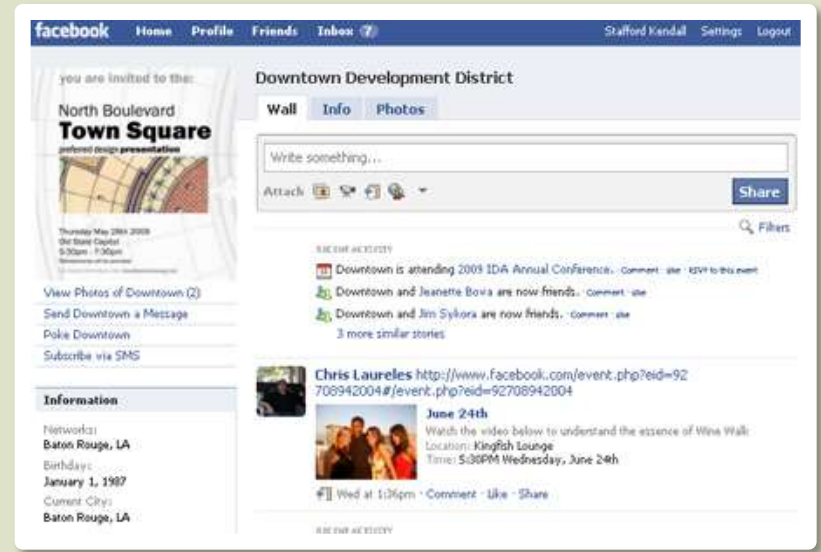
The DDD's Facebook Page with Over 1500 fans Web Site and Email Newsletters, Over 15,000 Subscribed Readers.