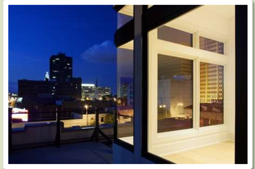
Condominiums Overlooking Third Street Over 35,000 square feet of new residential development

Officially established in 2008, the District brings together many of the plans, projects and initiatives that the DDD has led over the past two decades to reposition Louisiana's Capital City as a regional arts and entertainment hub.