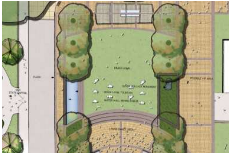
Outdoor Green Space Continue to Grow in Baton Rouge