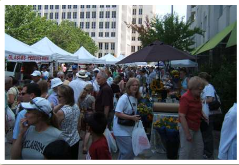
Outdoor Festivals Continue to Grow in Baton Rouge The New Plan Makes Space for Temporary, Pop-up Retail