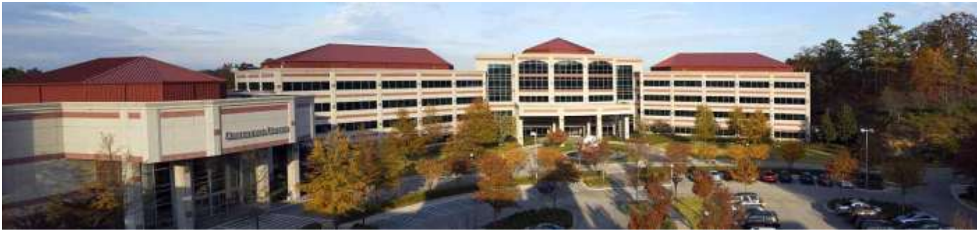
ECA Corporate Headquarters, Birmingham, Alabama