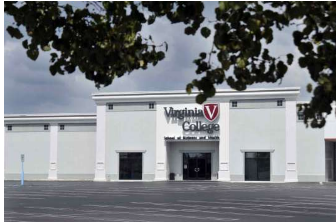
...New building AFTER redevelopment