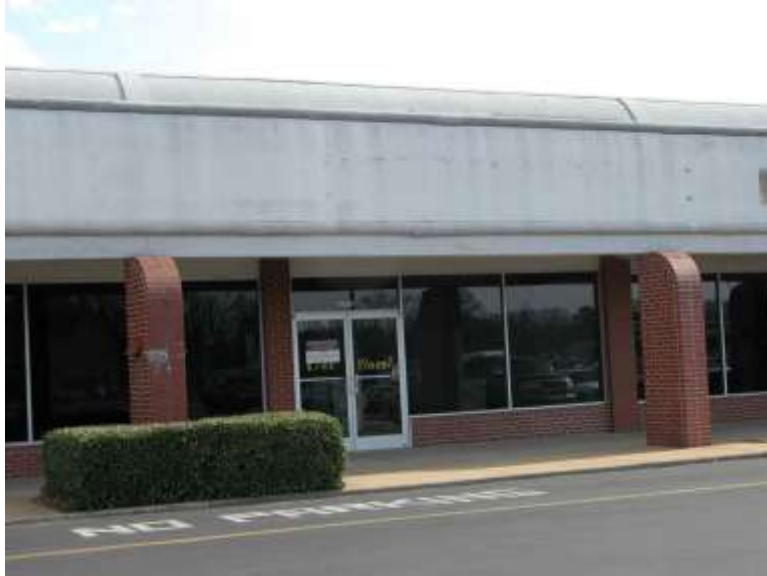
Rundown shopping center BEFORE...